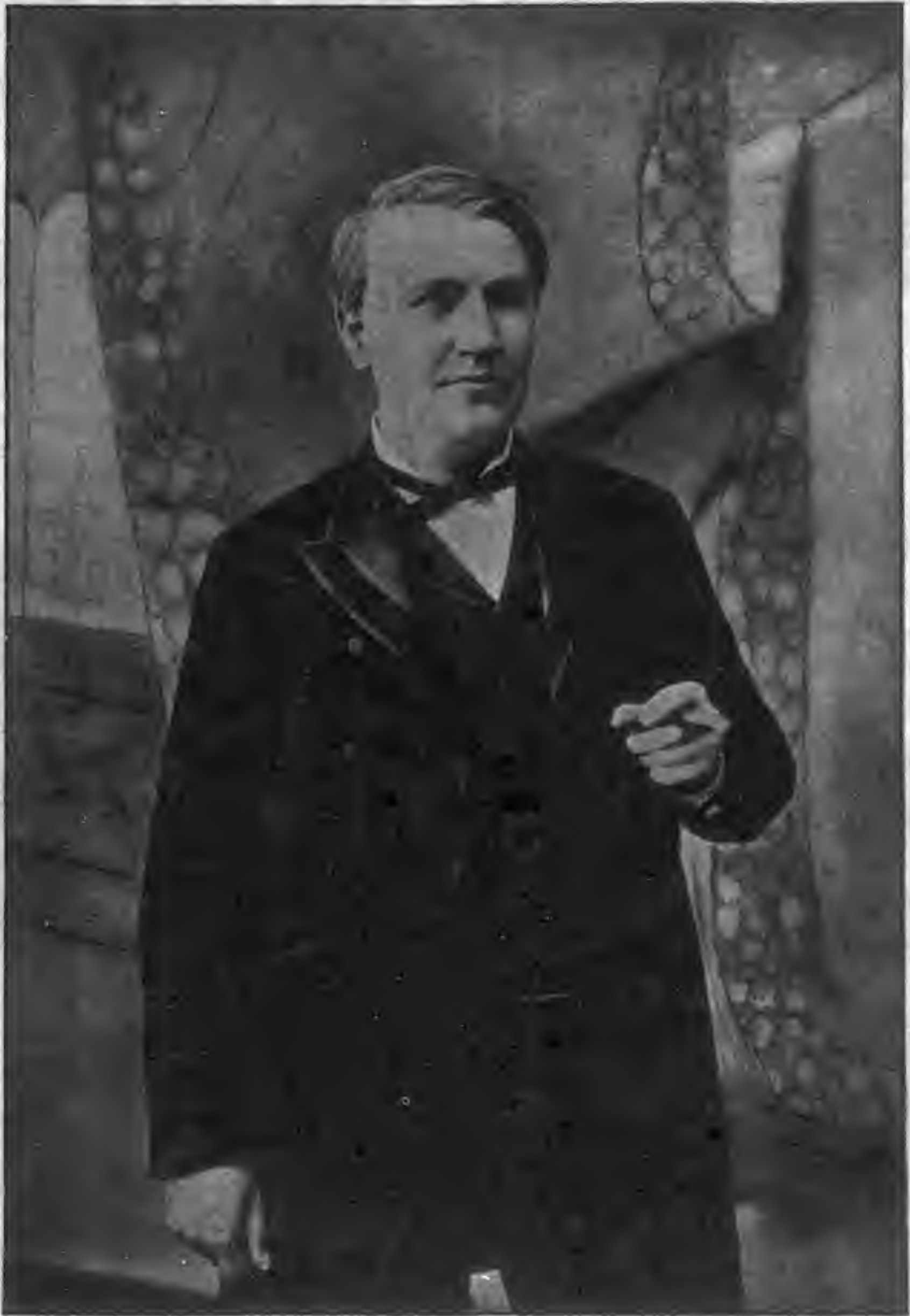
THOMAS A. EDISON, Inventor of the Phonograph and President of the North American Phonograph Company.